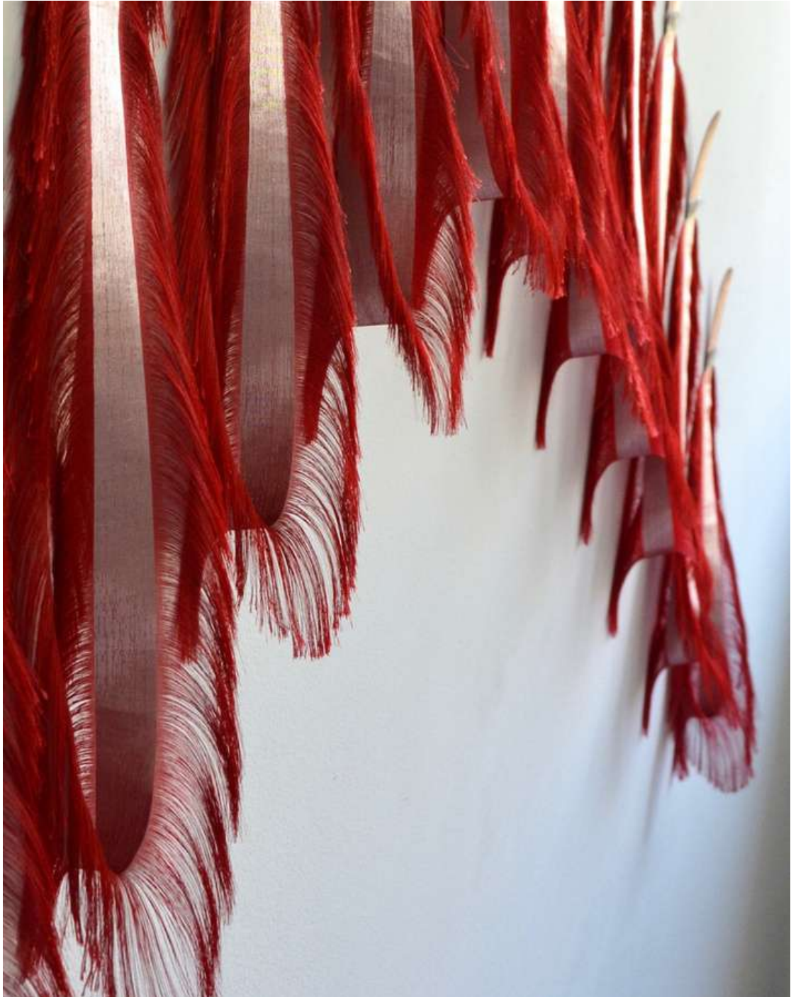
Frayed fabric ribbons cm.160x100 year 2021