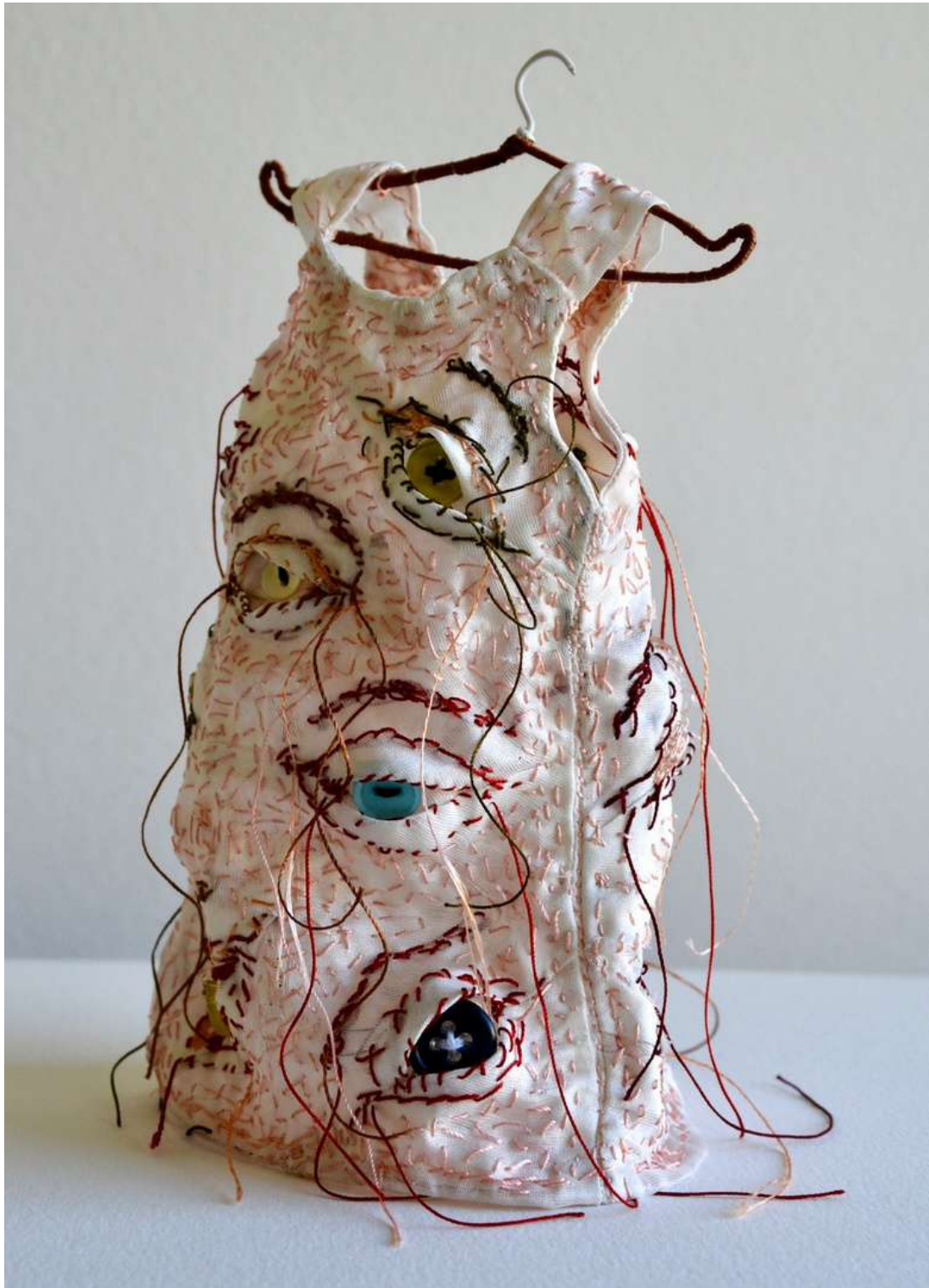
Embroidery | Silk, silk threads, buttons | cm.13x13x20 | year 2023.