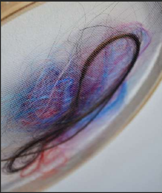
Synthetic hair, tul, wooden frames Variable dimensions year 2022