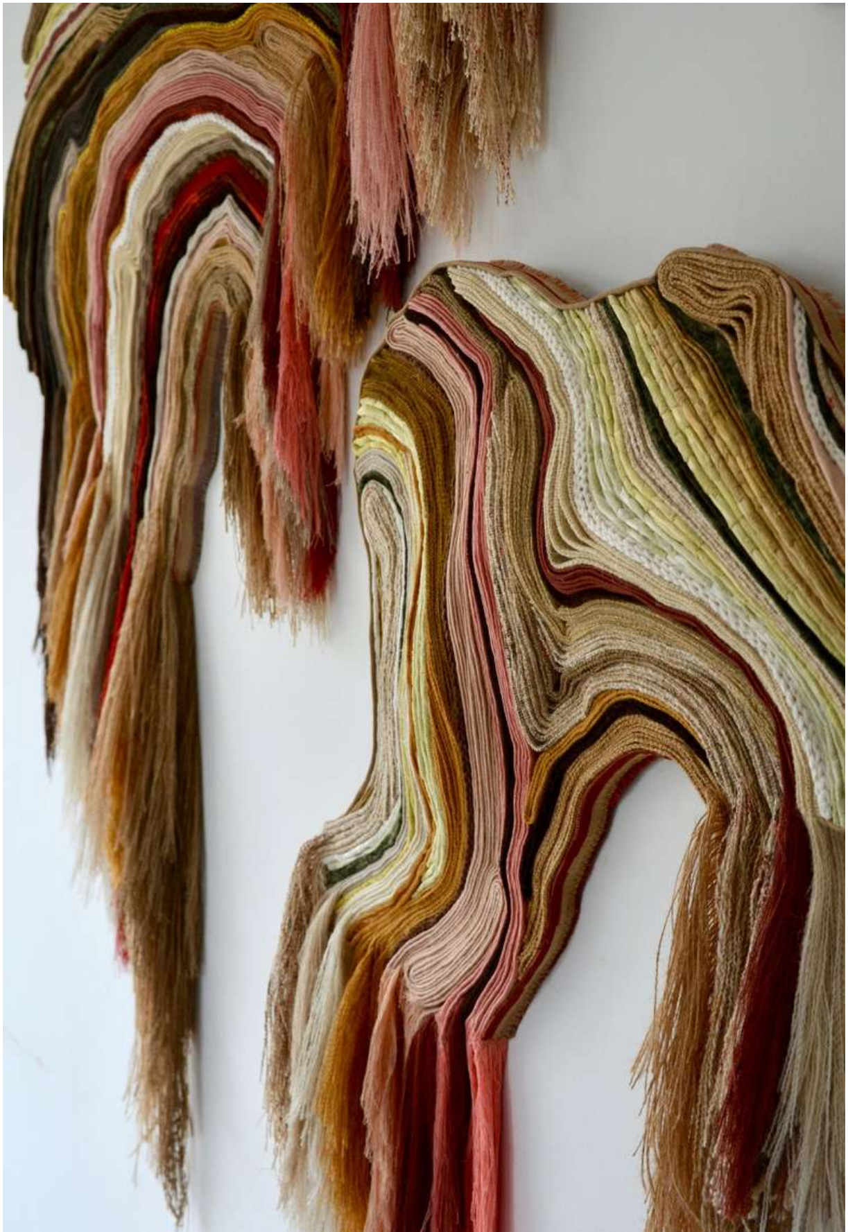
L'AMBIGUITÀ DEGLI ORIZZONTI | THE AMBIGUITY OF THE HORIZON Textile Installation | Hand sewn fabric folds on wood | cm.200x170 | year 2024