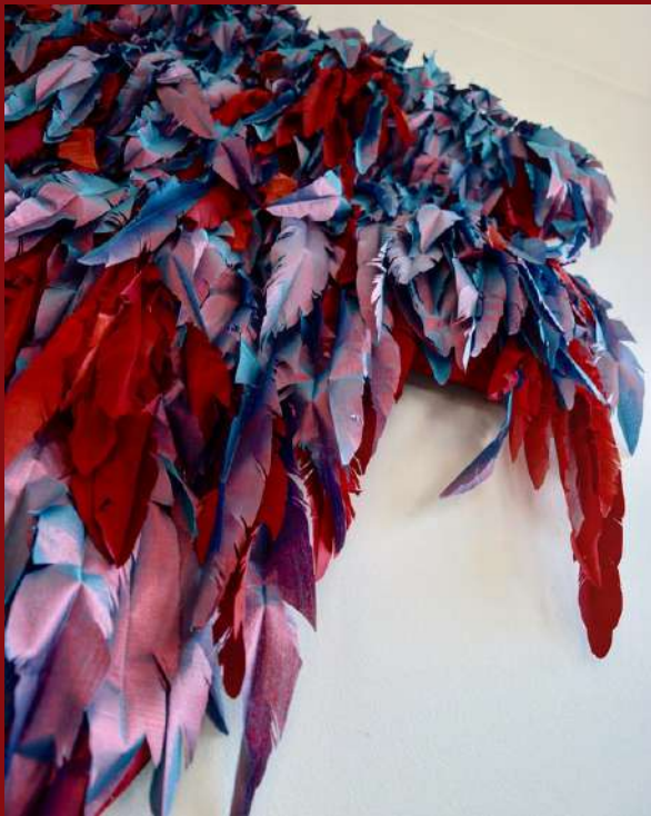
Hand sewn cut outs fabric cm.200x150 year 2018